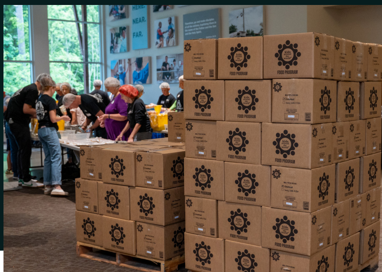
We packed 25,000 meals in one day for families in Sierra Leone, Africa, through our partnership with Children of the Nations.