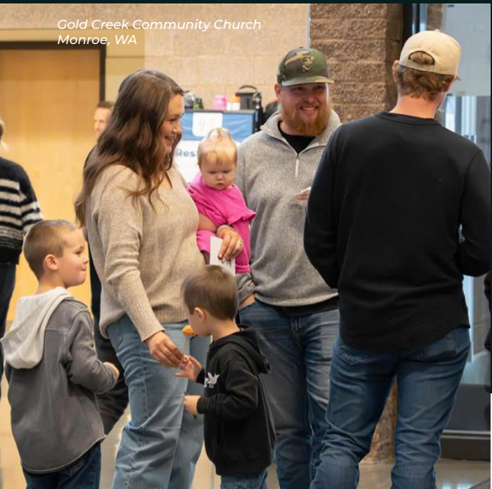
Gold Creek Community Church Monroe, WA