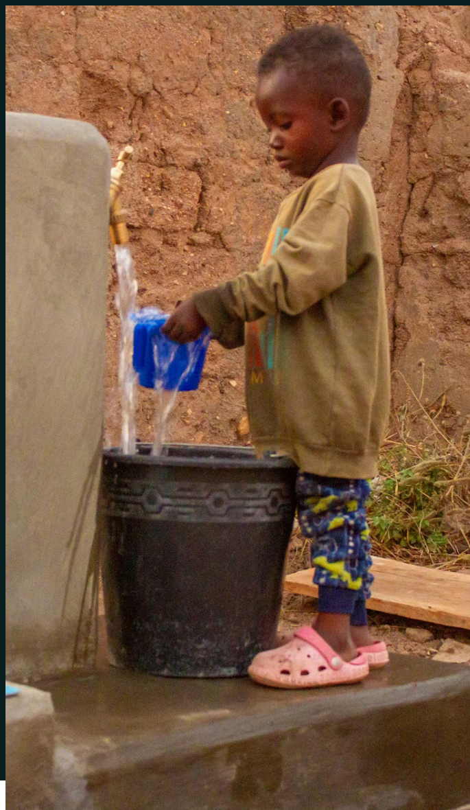
We provided the funds to build a NUMA Water filtration and distribution system to bring safe, clean drinking water for 28 families in the village of Gyili, Ghana, through our partnership with Water4.