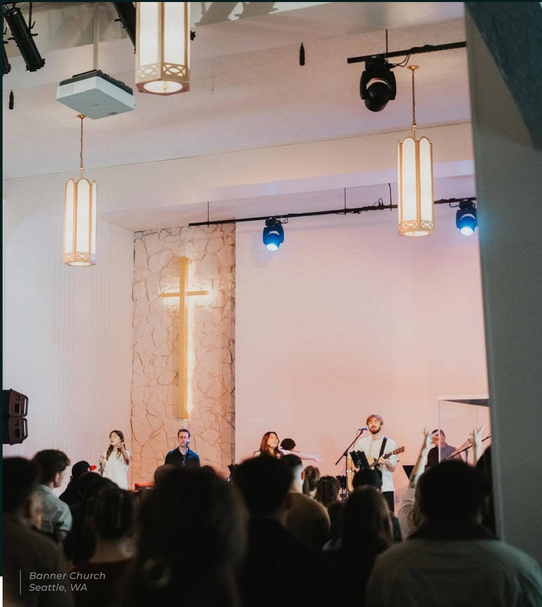
Banner Church Seattle, WA